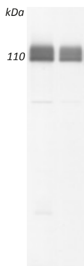
Western-blotting of mouse brain extracts