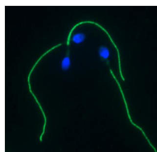
Immunofluorescence of human spermatozoa