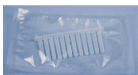
12-tip comb for 96 Deepwell plate (Cat.# 21103)